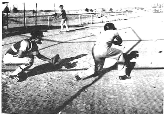
EAGLES PREPARE FOR COMING GAME

Season tickets for all the home games are on sale in the Activities Office for $1.00, and admission is $.50 at the gate.