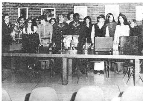
SPEECH CLUB STUDENTS

significantly changed.' The debate teams research it and attempt to win their side of the argument with the presentation of evidence beneficial to their side. They do not try to come up with a solution to the problem--the object is to win. The students are rated at a meet by their presentation and their win-loss record.