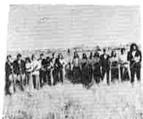
Orchestra judged in contest.

All the groups were allowed to warm up first, and then to present their prepared pieces. Three judges listened to the pieces with the full score of music in front of them. These judges then ranked them from one to five, according to tone, precision, taste of music, and interpretation. The choir was also judged on lyrics.