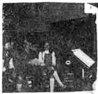
Chorus receives first overall.

The judging was on a point system, one through five. One is superior and five is unmentionable. In the past years very few schools have received ones. Cheyenne Mountain has probably received the most.